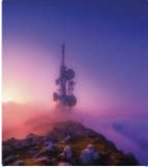
5G & 6G