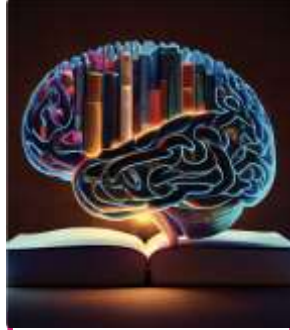
ARTIFICIAL INTELLIGENC E