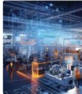
ENTERPRISE TRANSFORMATIO N